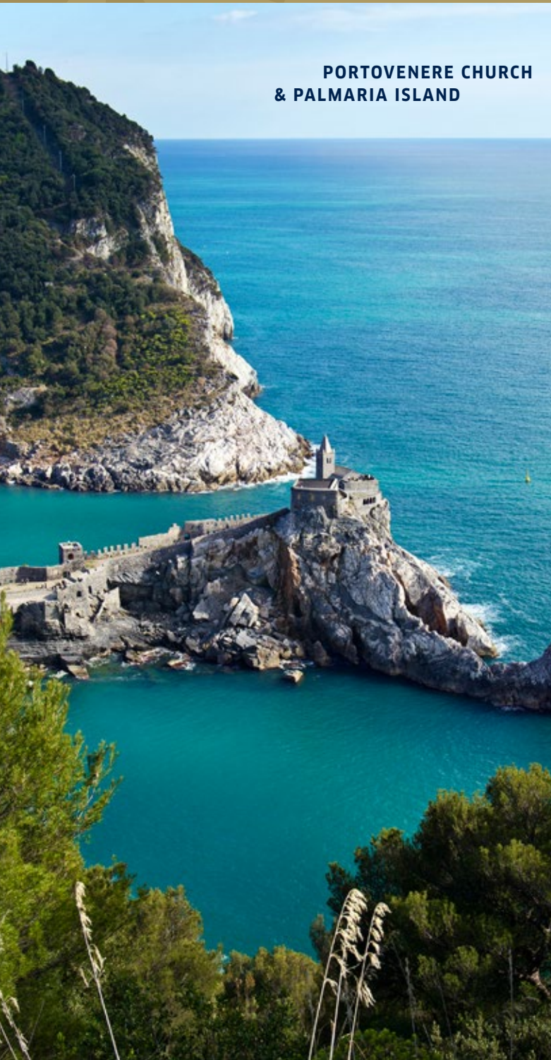
PORTOVENERE CHURCH & PALMARIA ISLAND

WE CAN FASHION A TAILOR-MADE PROGRAMME TO SUIT YOUR TASTES