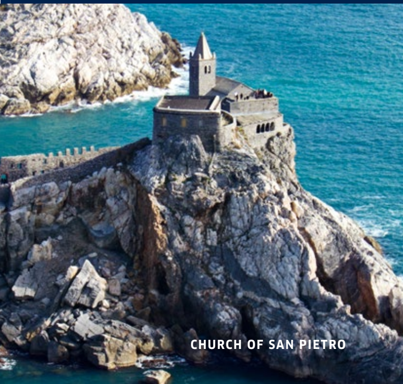
CHURCH OF SAN PIETRO